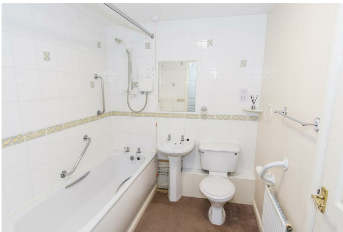
White three piece suite comprising WC, wash hand basin

and panelled bath with electric shower over, emergency pull-chord, shaver point, radiator, airing cupboard off housing modern Worcester combination central heating boiler and radiator.