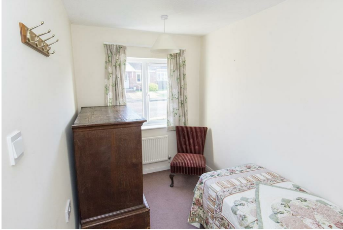
UPVC double glazed window to front, radiator.